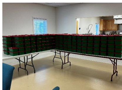
227 Shoeboxes delivered!

Have a happy and Blessed Christmas and may there be Peace on Earth.